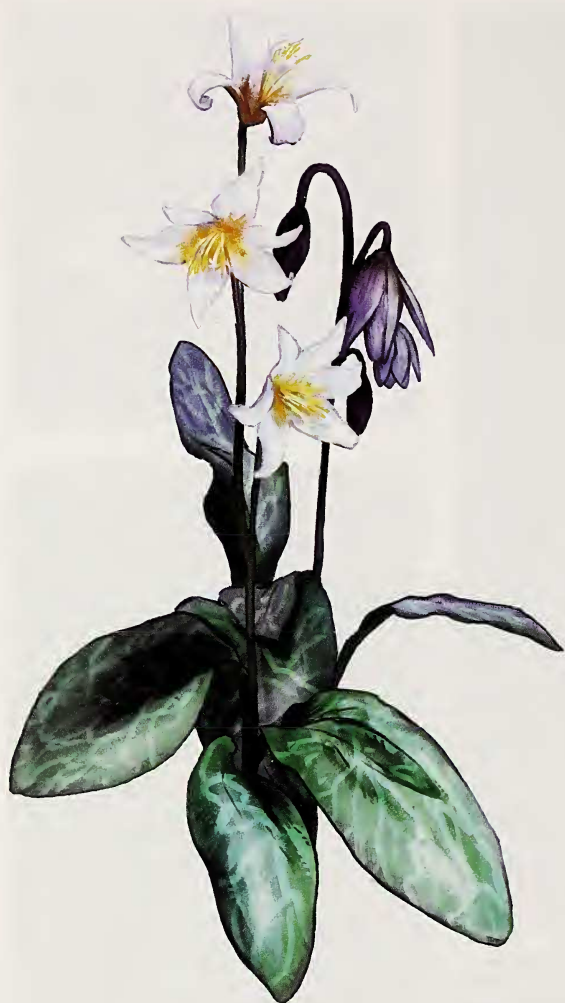
FIG. 4. Erythronium shastense watercolor. Illustration by Paul C. Reinwand © 2015.